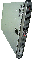
InnGate 3 E Series