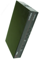
InnGate 3 M Series